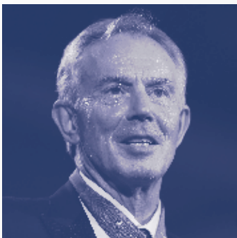
Tony Blair , former UK Prime Minister