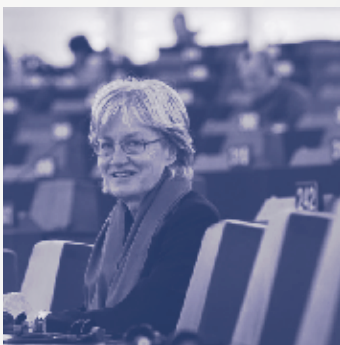
Mady Delvaux , MEP, Vice Chair Committee on Legal Affairs